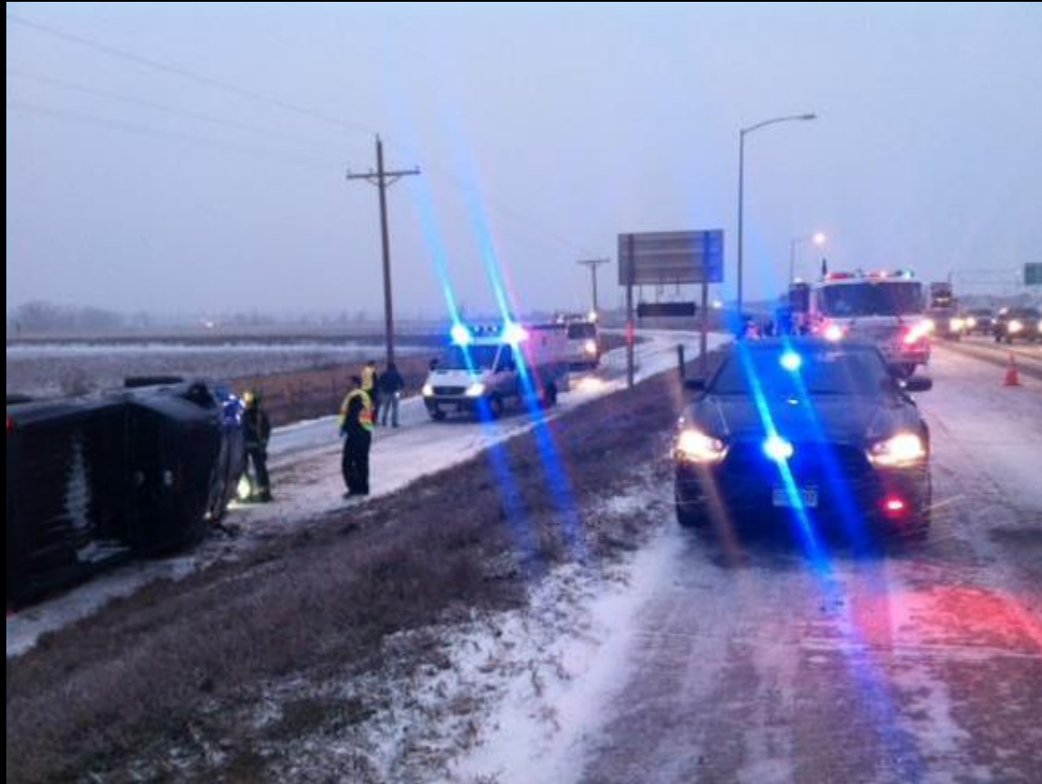
TIM in Northern Colorado in 2012