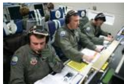
Command and Control

National Guard capabilities revolve around ten major components – “The Essential Ten” .